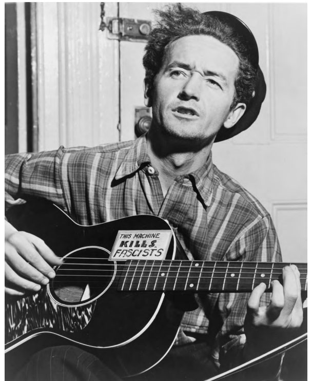
Mr. Woody Guthrie playing his emblematic guitar.

Mr. Woody Guthrie was born in 1912 in a small town in Oklahoma called Okemah. He is a singer-songwriter and musician whose musical legacy includes hundreds of political, traditional, and children's songs. Many of his songs are about his experiences during the Great Depression when he traveled with displaced farmers from Oklahoma to California and learned their traditional folk and blues songs, earning him the nickname the "Dust Bowl Troubadour".