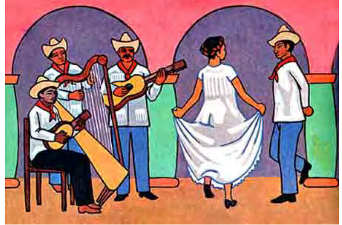
A typical “son jarocho” group with dancers.

Listen to the instruments played in “ La Golondrina ”. The first instrument you hear is a requinto from the same family as the jarana , and is the one in charge of introducing the melody of the song. Other than the jarana , the leona and the violin , can you guess which other instruments are being played? Who's playing the percussion in the ensemble? Which of these instruments are common in other music? What instruments are different?.